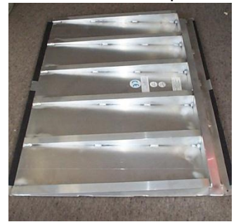
Underside of a TH2432 & TH2436 ramp